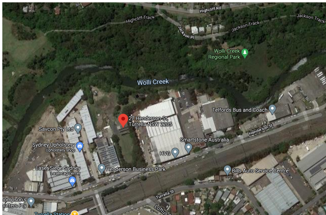
Figure 1: Turrella Ventilation Stack Facility