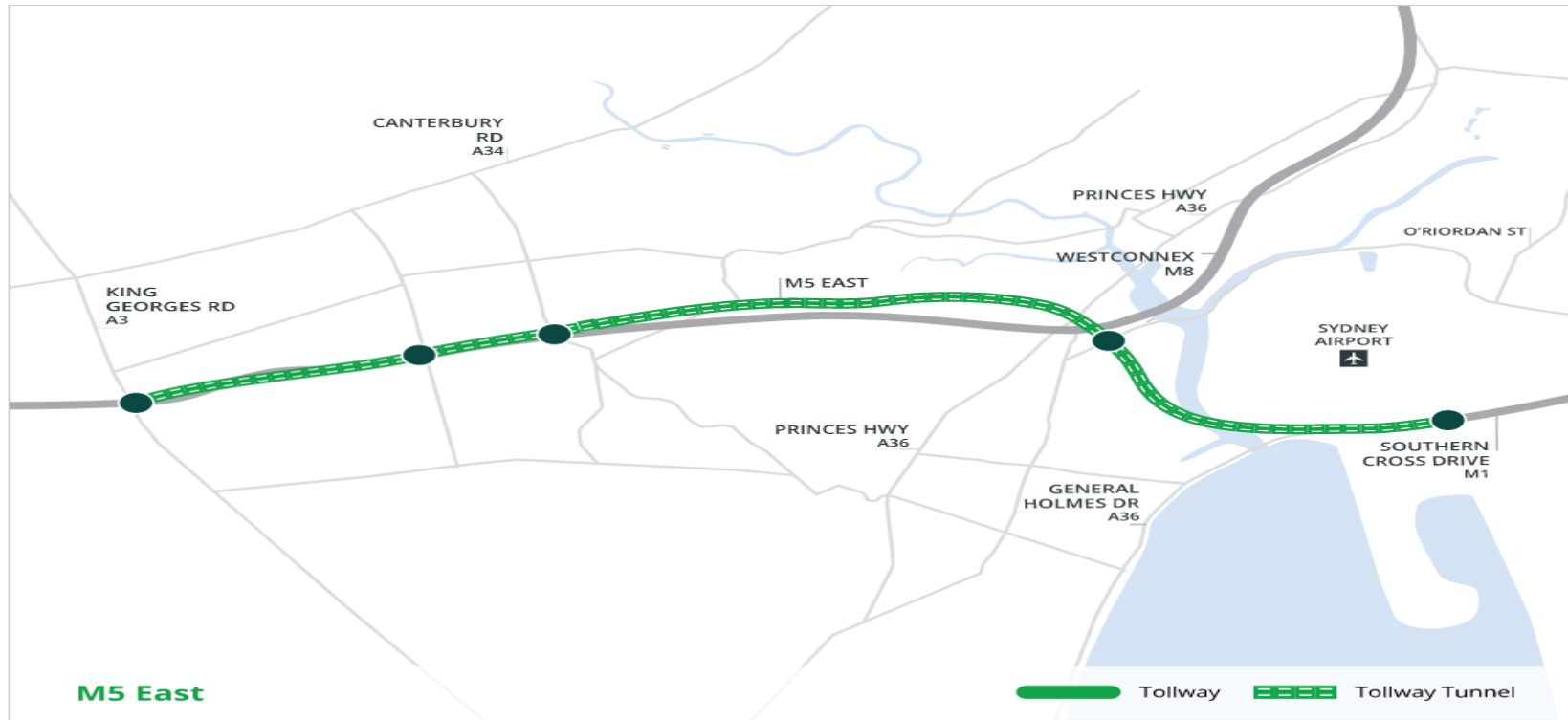
Figure 3 Broader Location Map