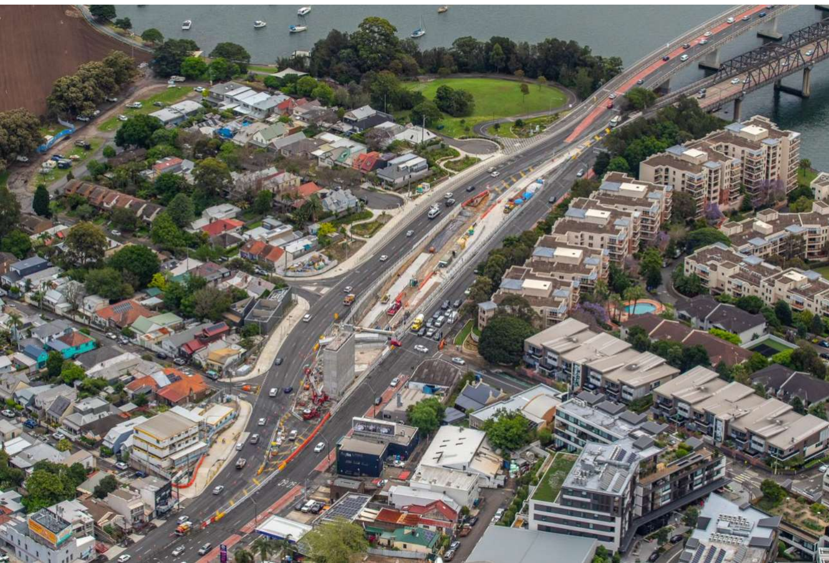
Victoria Rd Iron Cove