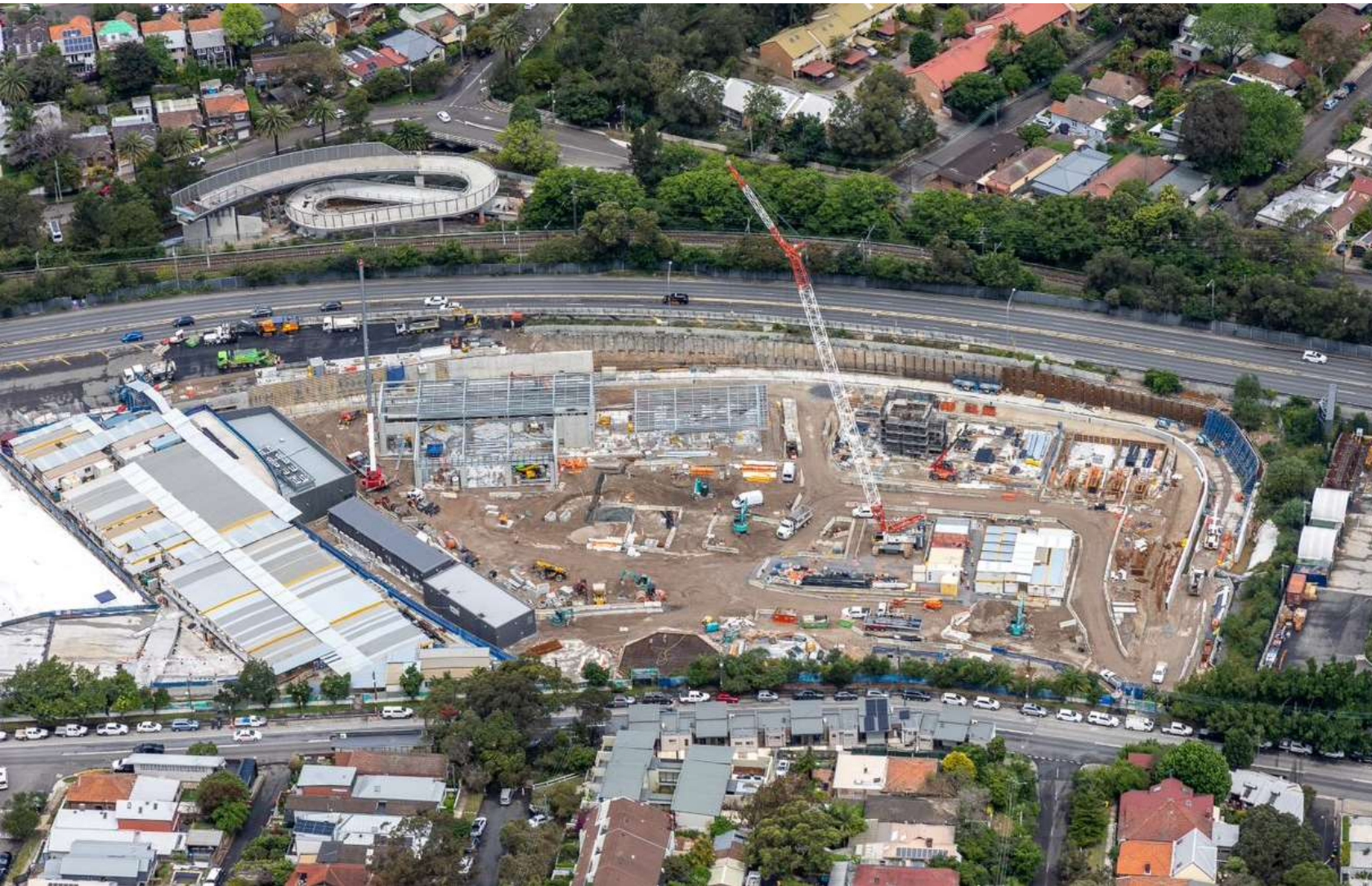
Brennan St Bridge and Motorway Operations Complex