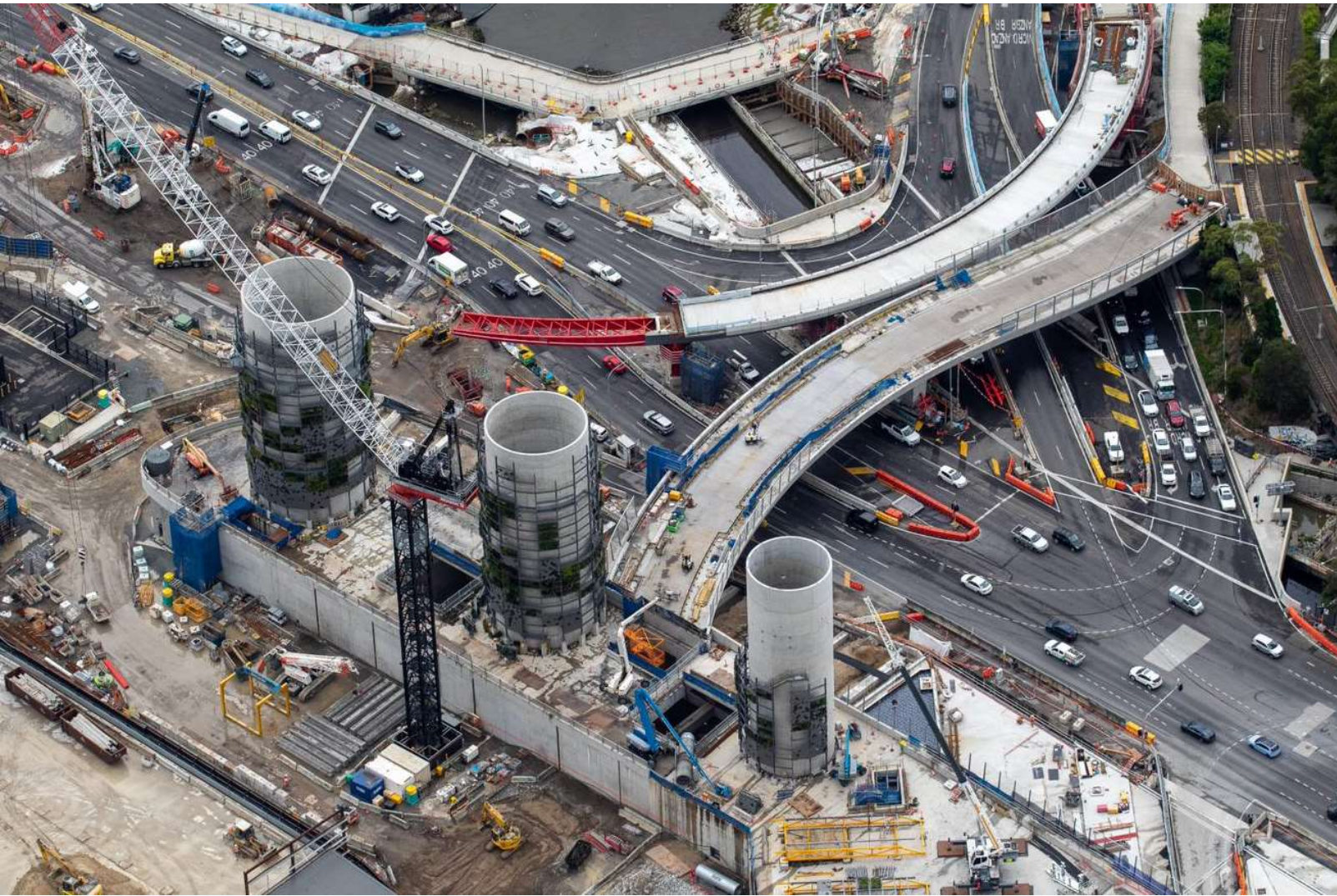
RRY Ventilation Facility and the Crescent bridges