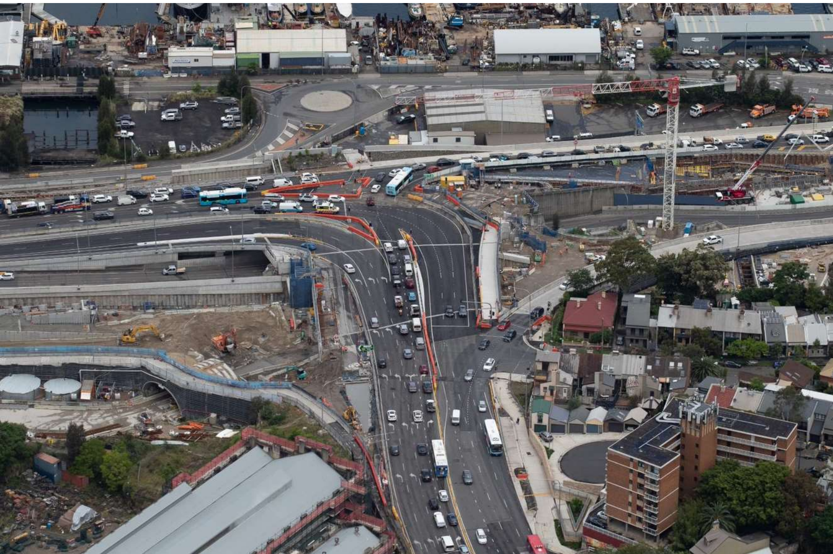
Victoria Rd / The Crescent intersection